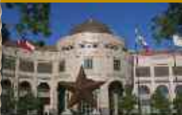
ACVB Photo/Bob Bullock Texas State History Museum